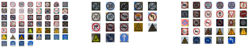
Figure 2: In-distribution (left), seen (middle) and unseen(right) out-of-distribution partition classes from the proposed Tsinghua split.