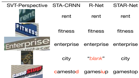
Figure 4: Some examples from SVT-Perspective dataset. "blank" represents the output is empty.

Experiments are next carried out on the Street View Text Perspective dataset (SVT-Perspective). In SVT-Perspective, most of the images suffer from severe perspective distortions. Table 3 shows that our STAR-Net outperforms other state-of-the-art methods on both lexicon-based and lexicon-free recognition. By comparing the results of CRNN and STA-CRNN, we can see the improvement brought by the spatial attention mechanism for highly distorted text images. Besides, it is interesting to notice that even without the spatial attention model, R-Net can achieve a slightly better performance than STA-CRNN. This suggests that having deeper convolutional layers with residue learning can also effectively make the network tolerant to spatial distortions of the scene texts. Some specific examples recognised by our networks are shown in Figure 4. In conclusion, the combining effect of the spatial attention mechanism and deep convolutional layers with residue learning makes our STAR-Net outperform other state-of-the-art methods for loosely bounded scene texts with considerable distortions.