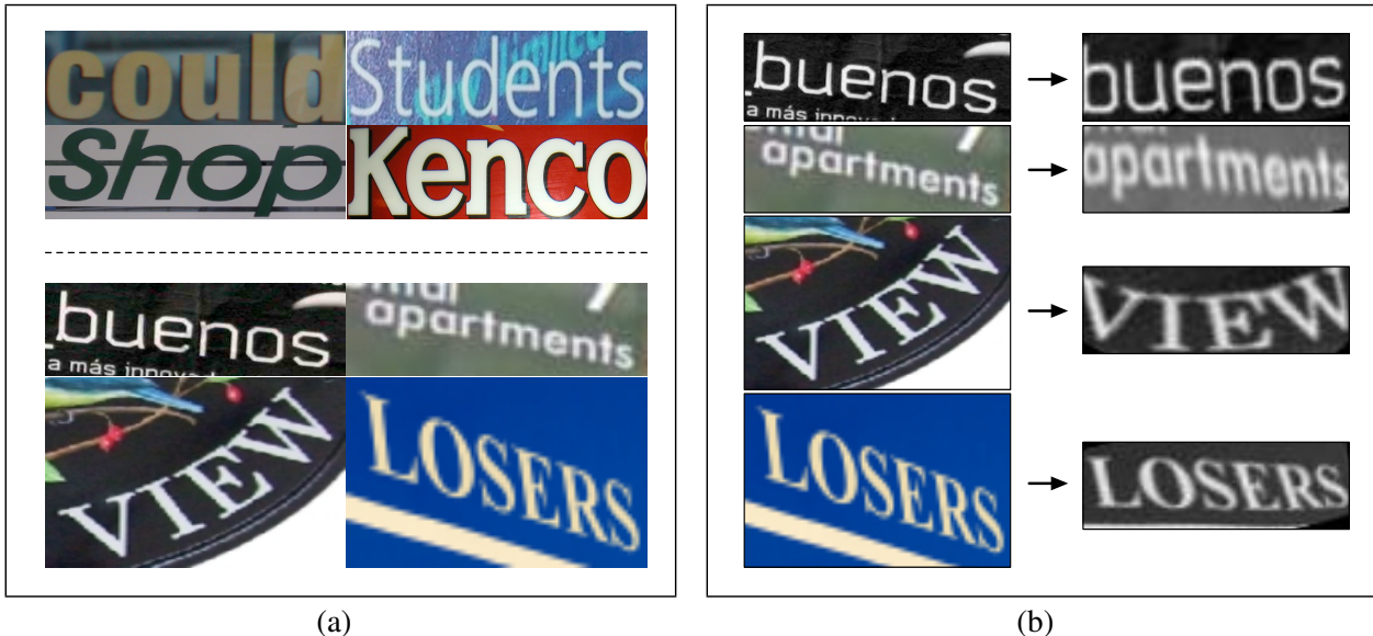
Figure 1: Text images from some public benchmark datasets and images rectified by our spatial attention module. (a) At the top are four tightly bounded, horizontal and frontal text images; at the bottom are text images suffering from different kinds of distortions. (b) Text images with different kinds of distortions are rectified by our spatial attention mechanism.