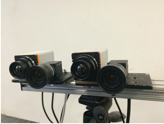
Figure 1: The four camera system

Video/Image Modeling and Synthesis Lab, University of Delaware Newark DE, USA