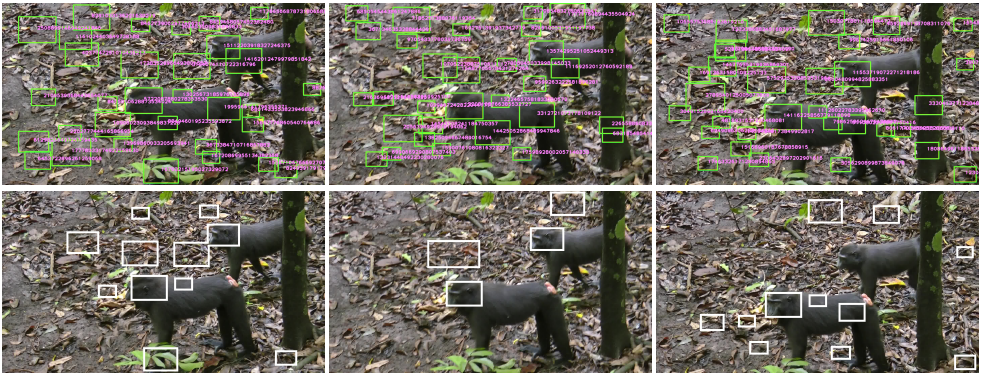
Figure 5: Detection results obtained for tracking the faces. Top row shows the detection results before tracking. Bottom row shows the detection results after tracking.

on video data that was not used for the testing of the tracking.