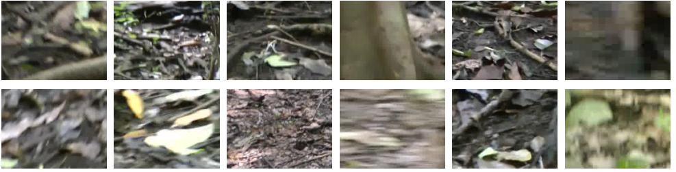
Figure 2: Selection of bounded images used for negative feature vector training. Here 427 images from forest scenes were hand-labelled for the presence of monkeys and then random sampling in terms of location and scale was performed to extract out 6829 images.

where R^{[t]} \in K_1 for t \in [t_1, t_1 + k_1] ; R^{[t]} \in K_1^+ for t \in [t_1 + k_1 + 1, t_1 + k_1 + v] where K_1^+ is the set of forward propagated regions for tracklet K_1 ; and R^{[t]} \in K_1^- for t \in [t_1 - v, t_1 - 1] where K_1^- is the set of backward propagated regions for tracklet K_1 .