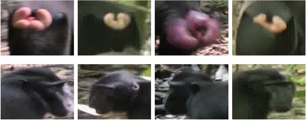
Figure 1: Top row: selection of the 824 hand segmented rear views of the Crested Black Macaque’s bottoms that were used for feature vector training. Bottom row: Selection of the images of Crested Black Macaque’s faces used for feature vector training from the manually segmented 186 frontal and 512 side views of monkeys’ faces.

occupy the majority of a bounded rectangle R^{[t]} ; which for convenience are defined as sets of pixel locations (x,y) \in R^{[t]} \subseteq \Omega where \Omega \subseteq \mathbb{N}^2 is discretely sampled image space defined on the set of two dimensional natural numbers. For a particular frame in time t there may be multiple detections, i.e.