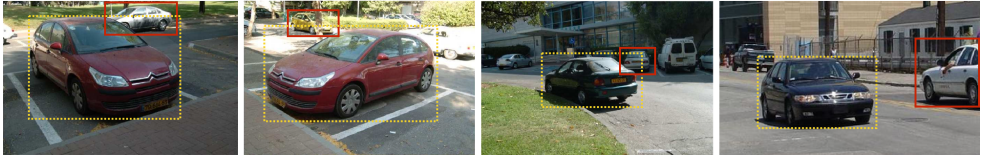
Figure 3: The results above illustrate the problem with measuring detection rate on datasets used to evaluate pose estimation. In each image there only one car is annotated (yellow dotted box). In these examples the top scoring detection (red solid box) is on another vehicle.

The main focus of our method is estimating the pose of an object. For completeness we also report detection results on two datasets: WCVP and CMU-car. Table 1 shows the average precision (AP) of our method using Ensembles of 20 and 40 correlation filters, and compared to using a non reduced set of 360 filters. We urge the reader to be careful when interpreting these reported numbers. Both datasets have images with multiple cars, but only a single instance is annotated. This can have unintuitive results, e.g. an improved detector may have lower AP. Figure 3 shows a number of instances in which the top detection is a car that is not annotated in the dataset.