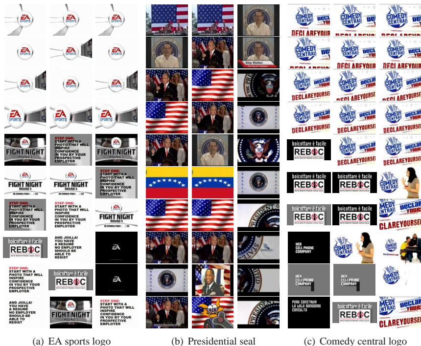
Figure 3: Multiple query retrieval on TrecVid 2011 dataset. (a)-(c) show three different textual queries and retrieval results. Within one example, each column shows a ranked list of images (sorted from top to bottom) for a particular method. Left, middle and right columns show Joint-SVM , MQ-Avg and MQ-Max methods, respectively. MQ-Max is clearly the superior method.