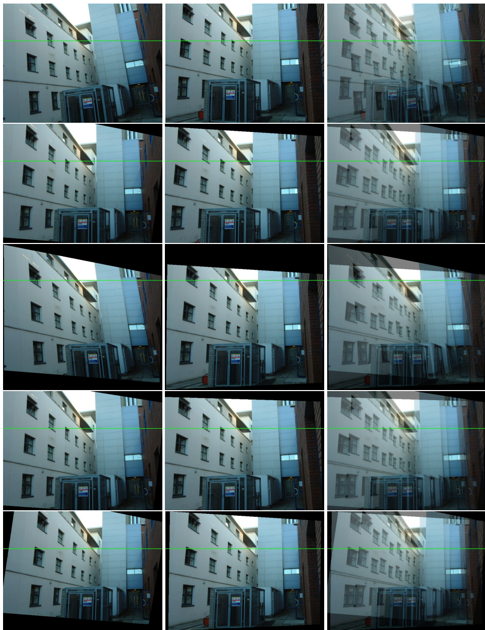
Figure 2: Image pair “Arch” rectified by different methods. From top to bottom: original images, proposed method, Hartley method, Fusiello et al. method and Mallon et al. method. A horizontal line is added to images to check the rectification. The third column represents an image average of each pair.