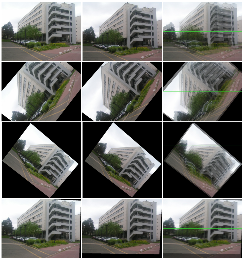
Figure 4: Image pair “Cournot” rectified by different methods. From top to bottom: original images, proposed method, Hartley method and Fusiello et al. method. A horizontal line is added to images to check the rectification. The third column represents an image average of each pair.