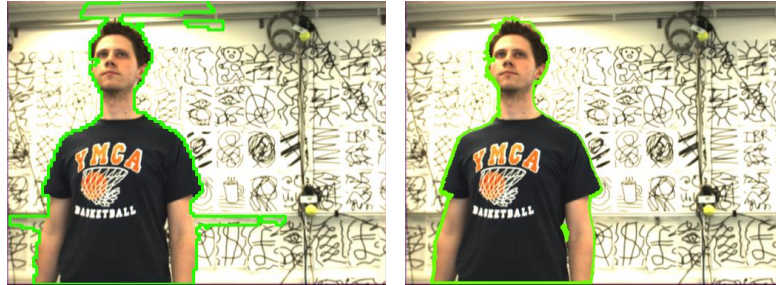
(a) Fixed foreground-background model. (b) Adaptive foreground-background model.