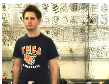
(c) Reconstructed from patches estimated with 'VH + MSMC'.