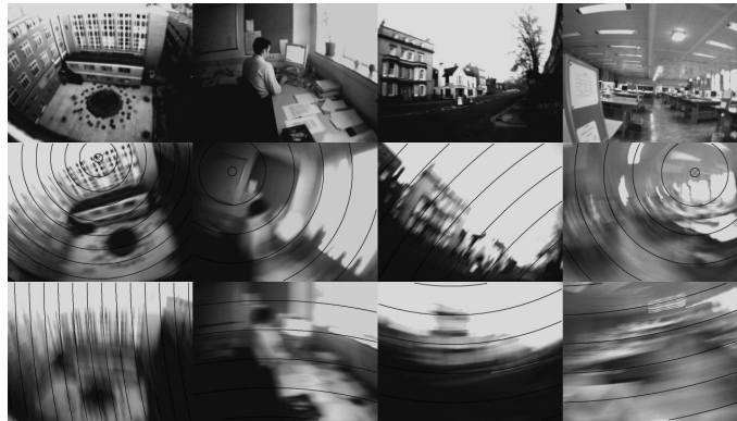
Figure 2: Rotation center placement results for four test scenes (un-blurred in top row.)

This section describes the performance of the system for sequences where the system can operate correctly. There are many scenarios in which the system will always yield incorrect results. These cases are discussed in Section 5.