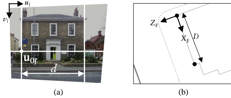
Figure 2: Building facades in the database are associated with a meaningful coordinate system using a map. (a) Two vertical lines are identified manually in each database view (the horizon line is also shown). (b) These lines correspond to points on the map (circles). The point \mathbf{u}_{0f} is the projection of origin of the facade coordinate system X_F Y_F Z_F .

2). Then \alpha_a = D/d and [u_{0a} \ v_{0a} \ 1]^\top is the projection of the origin of the facade's coordinate system X_F Y_F Z_F .