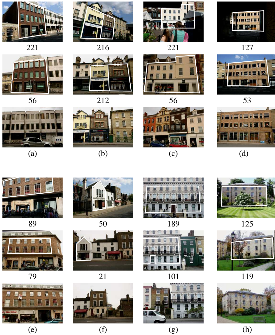
Figure 3: Illustrative database retrieval results. The first rows show query views. The second and third rows show the best and second best database retrieval results together with the number of robustly estimated correspondences. The first six images (a-f) show correct database retrieval results. Transferred building outlines demonstrate the accuracy of the recovered pose estimates. In (g), the correct database view has been recovered but the scale-plus-translation transformation is wrong. In (h), the wrong view has been retrieved because the two buildings are identical.