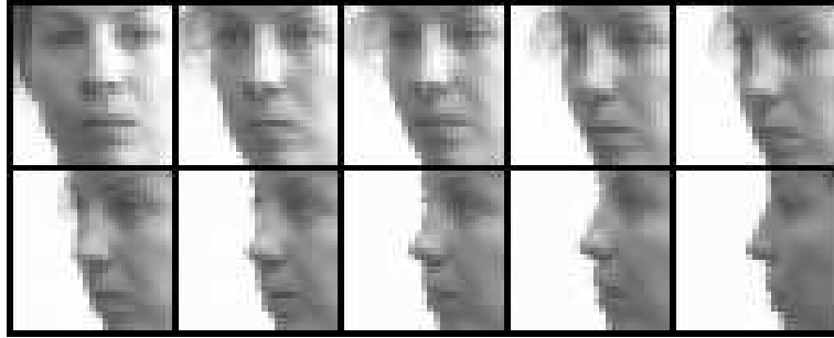
Figure 1: Entire 10-image range (rotating around the y -axis) for one person before preprocessing

training for individual classes into separate networks gives a modular structure that can potentially support large numbers of classes, since network size and training times for the ‘standard’ model quickly become impractical as the number of classes increases.