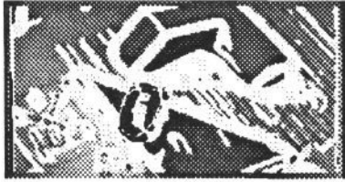
Figure 2: Showing the result of the C-test for outliers superimposed on the images shown in figure 1, white areas are the background and black areas are outliers. Grey areas are the intensities of the original regions with low ( E_x, E_y, E_t ) that are excluded from the regression.