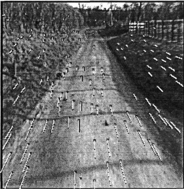
Figure 1: An image from a motion sequence with flow vectors of tracked corners superimposed on it.

points are collinear). The same projectivity will predict the position of any point on the plane in the first image in the second image [11].