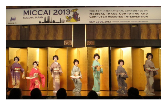
Traditional Japanese dance performance at the gala dinner

I was given the opportunity to present my work on "Accurate Bone Segmentation in 2D Radiographs Using Fully Automatic Shape Model Matching Based On Regression-Voting" in the Segmentation poster session on day two of the main conference. This year, all poster presentations were introduced with a short poster teaser talk followed by a guided poster tour which allowed for additional explanations and gave room for discussion. My poster presentation was very well attended. I much enjoyed explaining my work to a number of researchers from all over the world. This presentation gave me the opportunity to show my research to a wide audience and to discuss its applicability and implications. I answered several interesting questions, received valuable feedback and gained insights into potential future research topics. In addition, I made new contacts with researchers who are working in a similar or related topic.