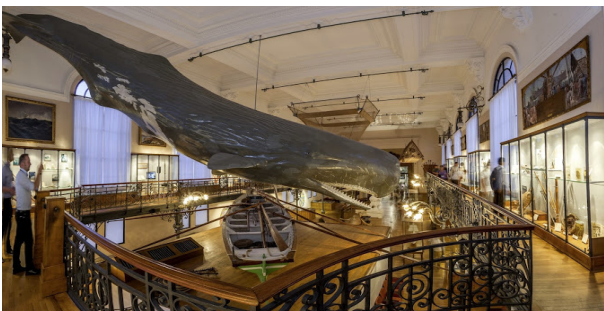
The Oceanographic Museum of Monaco

After the third and last day of talks all 1000 or so participants of the conference were taken on buses for an evening in Monaco at the famous Oceanographic Museum. The museum provided great views over Monaco and many exotic fish to admire. However the catering staff were overwhelmed by the hungry scientists that were competing over small bites of food as soon as they appeared from the kitchen.