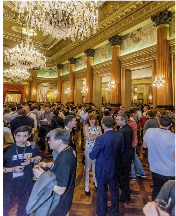
Reception at the Palais Sarde

difficulties to predict, analyse or control organ deformations and to adjust in real-time the robotic movements. The evolution of surgery thus needs a revolution to overcome all these current limits. This revolution will consist in combining the best aspects of minimally invasive techniques from separate specialties, image analysis techniques, patient-specific simulation, augmented reality and robotics. The resulting approach will lead to image-guided minimally invasive hybrid surgery.