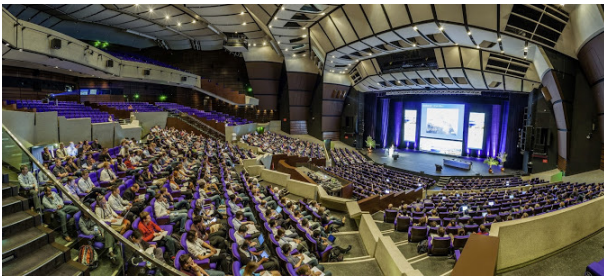
Keynote lecture in the Acropolis convention centre

great talk named “Preventing sudden cardiac death: role of structural and functional imaging”. He explained that sudden cardiac death is responsible for 350,000 deaths each year in Europe. However the identification of the vulnerable subjects is the fundamental problem in the reduction of this pathology, and a major scientific challenge. He showed how the role of structural and functional MRI imaging has improved patient-care by providing valuable and unprecedented guidance in the therapeutic management of several cardiac and non-cardiac disorders and that many of these modalities have replaced the invasive imaging techniques as gold standards (e.g., MRI or CT have largely replaced cardiac catheterization in congenital heart problems). He then demonstrated how a novel use of diffusion MR called track density imaging has been able to reveal the 3D arrangement of fibres within the ventricular syncytium and differentiate healthy muscle fibres (long continuous strands) from those surviving within the scar or at its borderzone (broken strands). The latter are considered to form an arrhythmogenic substrate and generate the so called ‘late potentials’ during sinus rhythm and are therefore very valuable targets for surgery.