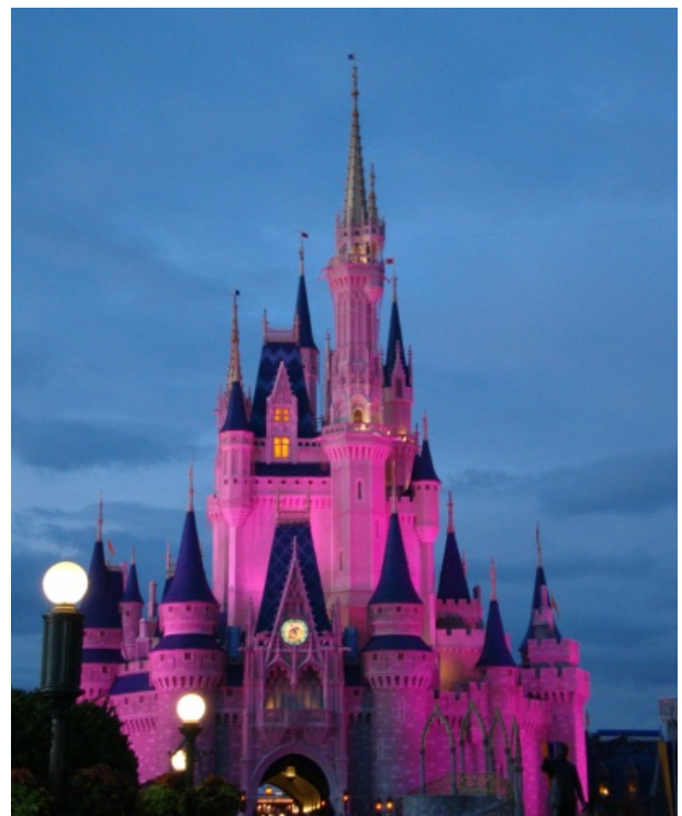
Castle in the Disney's Magic Kingdom

Another thing worth mentioning was the conference mobile app, developed new for this year. This provided