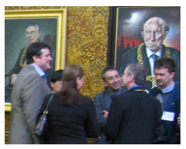
An animated conversation with the Lord Mayor.