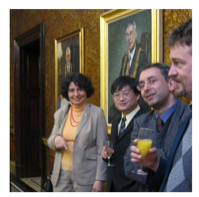
Earlier Lord Mayors look down on some keen participants!