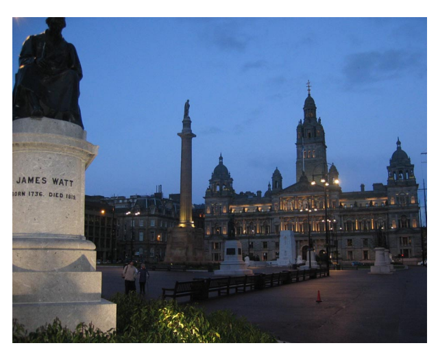
An outside view of the City Chambers.