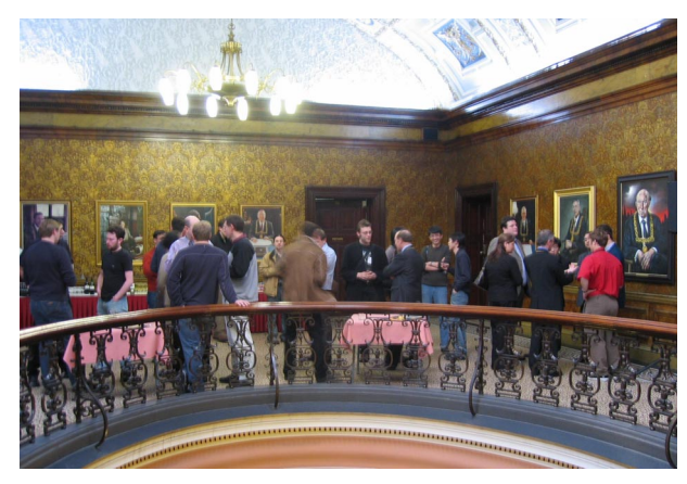
Memorable repartee at the drinks reception: this picture shows something of the splendour in the City Chambers.